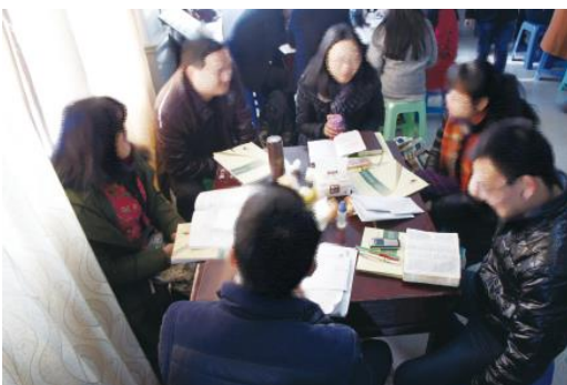
Church leaders and believers from the Eastern region formed a “Living Word” Bible study group, they share what they have read and learned from the Scriptures and discuss how to apply the teachings in their lives.