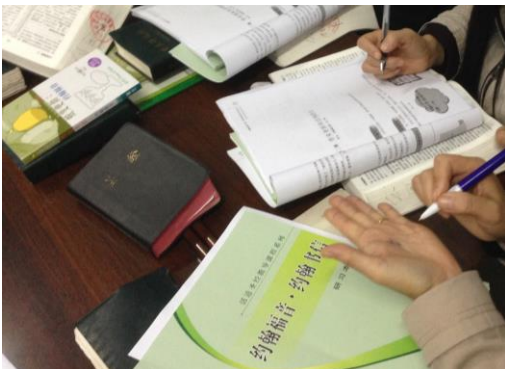
Church leaders from the Southwestern region are studying the Gospel of John and the Epistles of John attentively using the “Living Word” materials.