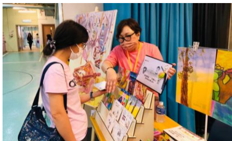
The bazaar was an opportunity for volunteers to share with the audience the story of the preacher behind.

Pray that the Lord will use the collaboration between partners, ministry teams, and local congregations to widen the scope of mission education.