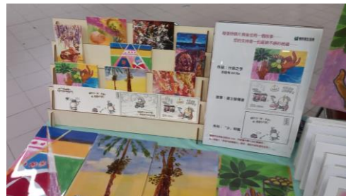
A wide range of products under “Great Work in Minorities” help promote mission education among different people.