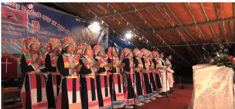
Lisu believers use their unique gift in music to praise God