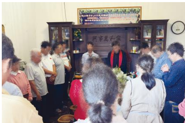
A local pastor not only preaches in the church but also conducts gatherings in different believers' homes