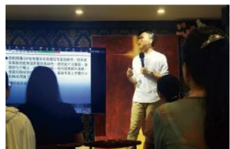
The instructor is visiting and sharing at the Hainan Marketplace Christian Fellowship.

Sometimes students want to receive training, but they often face challenges, namely, not letting go of their past, finding their wishes in conflict with those of their families, choosing alternative professional courses for further studies, etc. They seem to resemble the rich young man in the Bible who stood at the "crossroads" and was caught in the struggle of whether to move forward, stay right there, or turn back. "The marketplace is the harvest field", while churches in China are not yet ready to nurture marketplace Christians, the instructors' team is filling this gap and rendering these Christians the needed support so that they in turn can exert spiritual influence in the marketplace and harvest the field more effectively.