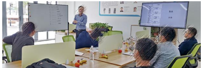
A marketplace teaching course is in session with the instructor physically present speaking to Christians in China.

Ministry update: From March to August, the instructors’ team has conducted 24 sessions of marketplace-related studies and exchanges, serving a total of 318 individuals. Each workshop cost USD 641; for the 24 workshops conducted, the total cost was USD 15,384.