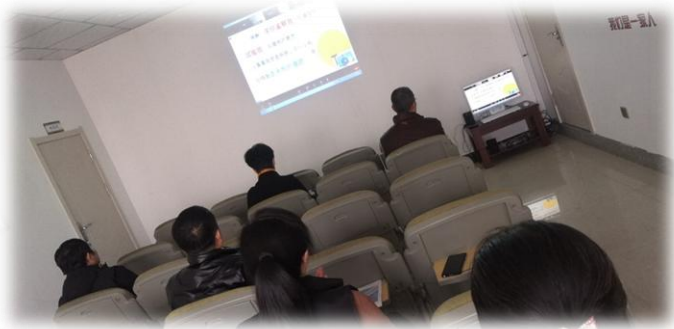
A church in the northeastern region delegated 8 members to attend the webinar.

Editor's remarks: Recognizing the significance of the adaptive capability of leaders in helping churches cope during the pandemic, the teaching team conducted a "Leadership Online Forum 2021 - Adaptive Leadership" in late March. A total of 105 pastors and Christian leaders participated in the online forum to discuss pertinent issues and share experiences. Some of the invitees even mobilized other members of their respective service teams to join the webinar so that they could have follow-up discussions on what they learned and more effectively take appropriate actions in their local churches thereafter. One church in the northeastern region delegated altogether 8 members to participate in the webinar. Upon completion, the team's pastor shared with us how mainland churches have been bombarded by the pandemic as well as what his team has gained and been inspired through attending the "Leadership Online Forum".