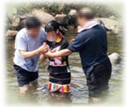
The girl whose life is changed by God's words is willing to complete a short-term bible course at the training centre.

There are, however, always more solutions than there are problems. Coworkers and ethnic minority believers continue to have a strong faith and work relentlessly to spread the good news. We reach out to different villages, pray for the sick, offer help to families hit hard by disasters and comfort them by sharing God's words with them. There is one family that we have been visiting quite frequently. The father of this family became seriously ill. We prayed for him and shared the gospel with him. This brought great comfort to the entire family. His daughter also needed support as she received dissatisfactory results from the college entrance examination. Christian brothers and sisters comforted her with love and the words of God. She was deeply touched and started to read the bible on her own. Later on, her father was taken away to be with the Lord; the daughter was greatly struck by grief. During her father's funeral service, I deliberately chose Revelation 14:13 as basis of my sermon. It turned out that she was deeply touched by the phrase "Blessed are the dead who die in the Lord". God's words continued to change her. She decided to enroll in the 3-month bible course at our training centre. Despite her father's death rendering the family financially insecure, the entire family is loving the Lord all the more.