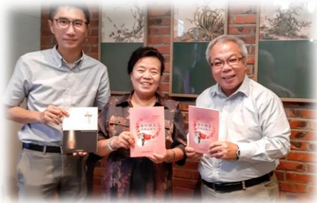
Members of the book gifting team give books on theology and pastoral care to the principal (middle) and teachers of the bible school in northern region.

The ministry of mainland theological education needs your support! While continuing the graduate book gifting project, we also specifically choose quality reference books from among the new publications in the mainland for seminary teachers so that these can be used as their teaching resources. Please send in your donation if you are motivated by our heavenly Father to partner with the mainland seminary teachers on their respective service paths. Thank you!