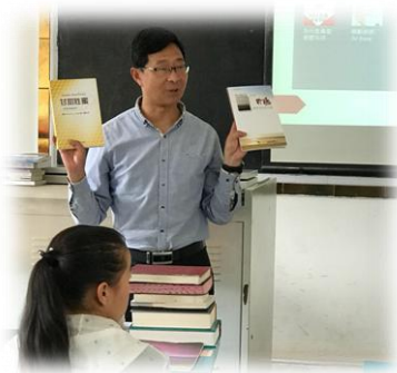
Teachers in the southwest region enthusiastically introduce their reference book resources on pastoral care to theology students.