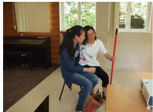
Learning through role-play with the help of group members.

5. We must understand that we do not fight alone! Students must transfer what they have learned to others, build up a team that is united, whose members fight together and help each other complete the great commission given by Christ. As Paul urged Timothy, "You then, my child, be strengthened by the grace that is in Christ Jesus, and what you have heard from me in the presence of many witnesses entrust to faithful men, who will be able to teach others also." (2 Timothy 2:1-2)