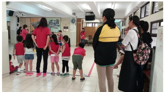
Students touring a church in Hong Kong

As the course 1 comes to an end for this session, here are a few things that the teachers hope to give to the students. May it serve as a reminder for us as well: