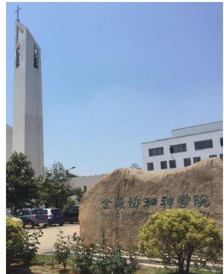
National Level Seminary

Firstly, in terms of campus facilities, each operated under two policies since the opening of China: “It is hoped that you will run theological seminaries well. You must think of all sorts of ways and use all sorts of methods to train successors [...] especially to run theological seminaries well”(3) and “Running high level theological seminaries and combining intermediate and junior level theological seminaries are the better method for accelerating the training of a new generation of pastors and theological researchers who love the country and the church”(4). Under these two policies, theological seminaries have begun to operate or reopen.