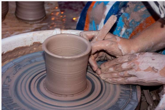
A Life that has Experienced Moulding and Renewal