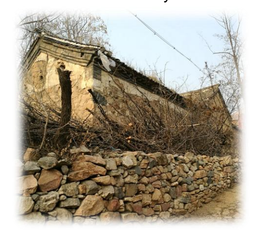
Owing to problems in technical equipment and stability of network signals in rural villages, believers find it hard to stay focused during online gatherings.

In some rural villages where most believers are middleand old-aged, the situation is even more serious. While most of them go online via their mobile phones and do not have a problem using text and voice, viewing direct broadcasts and taking part in interactive sessions is another matter. The unstable network makes it difficult for them to concentrate, causing much frustration among pastors.