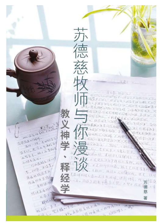
Publishing the spiritual wisdoms and teaching notes of church leaders

It has been 45 years since CCL's establishment in 1971. We have published over 1,500 Christian literatures, mostly in traditional Chinese. In the 90s, we gradually started to publish