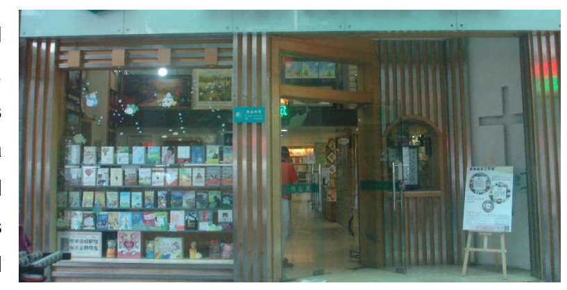
A Christian bookstore in the mainland

of the 90s, private Christian bookstores began to open, mostly operated by believers with a heart for literature ministry. These bookstores flourished the most during the first 10 years of the 2000s, with 500 bookstores around the nation at its height. Regrettably, because most operators lacked basic experience in operations management, and other factors such as the instability of the volume of new books, most of these bookstores had a lifespan of just 3 to 5 years. Nowadays, the number of bookstores remains at around 200. These workers of literature ministry operate and struggle on the margins of official policy for the sake of that historic calling from the Lord!